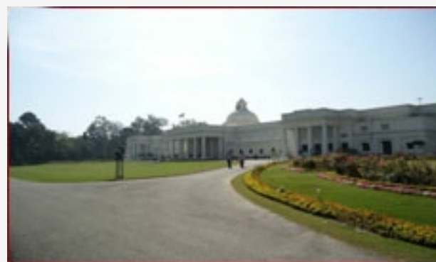
Main campus Building of IIT Roorkee