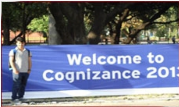
Bibhuti Bhusan attended Cognizance '13