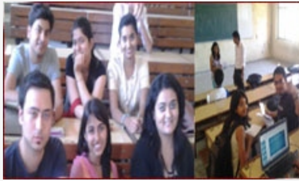
Students from DCE, Gurgaon at Technical fest of NSIT