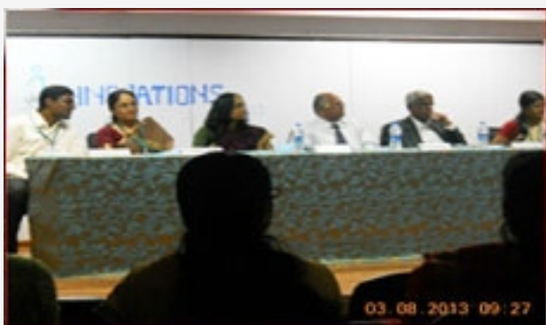
The Dignitaries at Project Competition Held at SIES College, Mumbai