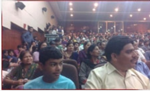
Audience at Ethical hacking event