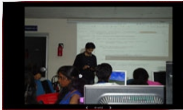
Participants attended the workshop