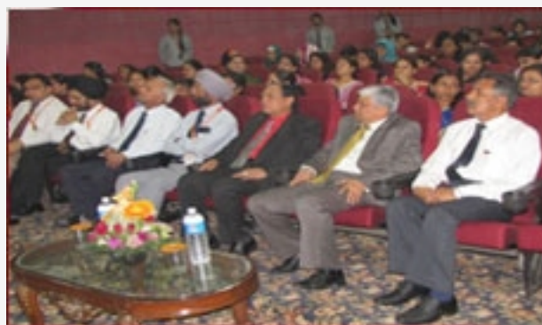
Dignitaries at Drontech 2013 in Dronacharya College of Engineering, Gurgaon