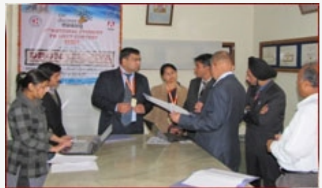
Judges judging various projects exhibited in the competition