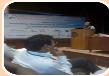
Seminars and Summits